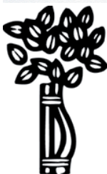
SGOT - Schweizerische Gesellschaft für Orthopädie und Traumatologie